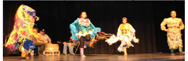
Above, Dance by Ranch Ehrlo Society Powow Club