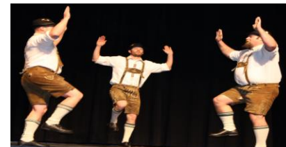
Dance by men of Regina German Club.