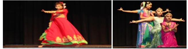
Dances performed by Natya Sudha Dance Group