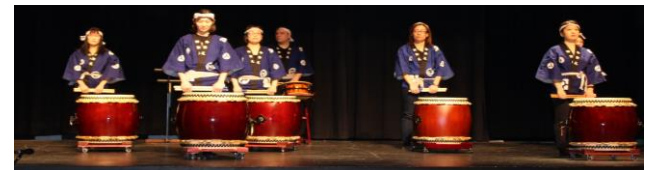
Drum/song by Regina Hibiki Taiko Japanese Group