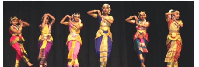
Dance by members of the Gujarati Language School