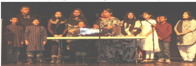
Song presented by the Bangla School of Regina

Those in attendance were then entertained by a wide variety of groups representing some of Regina’s multicultural/multilingual community, too many to include photos of all, but below are photos taken of some of the groups that did perform on stage.