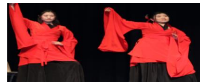
Performance by the Confucius Institute Dance Group.