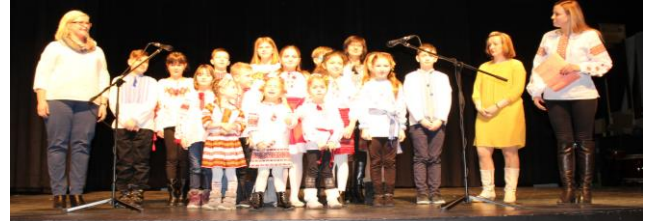
Performance by Ridna Shkola Ukrainian School